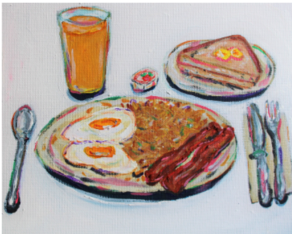
"Classic Breakfast" Olivia Anderson